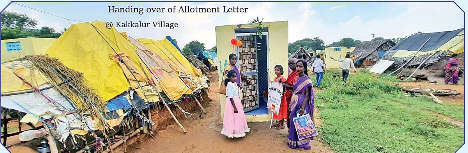
@ Kakkalur Village