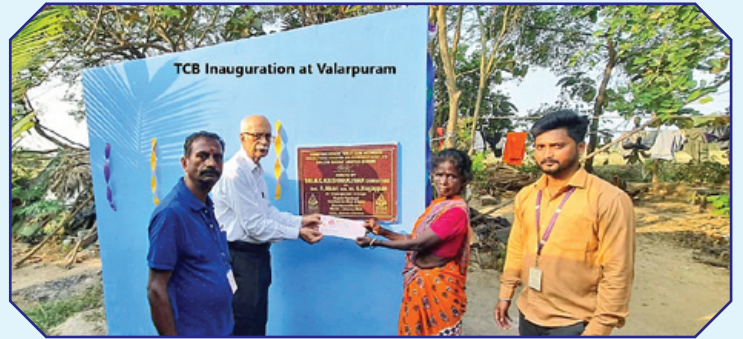
Handing over of Allotment Letter